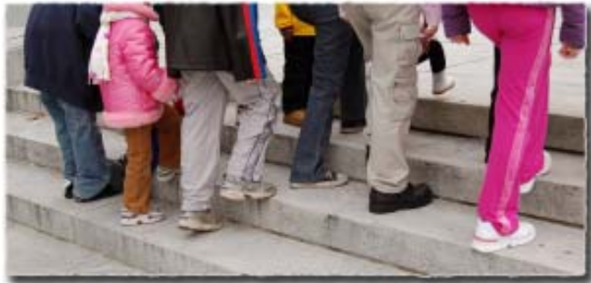
Take steps to lead us in the right direction!

A message from more than 125 member agencies of the Pennsylvania Council of Children, Youth & Family Services